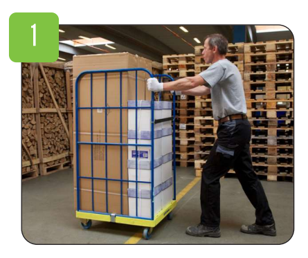
Stand with one foot in front of the other and slightly bent knees when pushing the cage.