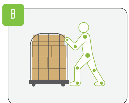
Brake the cage by putting one foot in front of the other and use your body to push back.