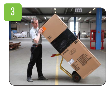
Tip down the box until it is balanced and the weight is resting on the trolley wheels.