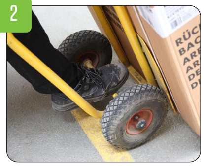
Block the sack trolley with one foot to prevent it from moving backwards.