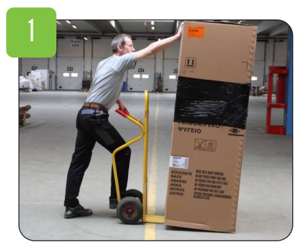
Tip the box slightly forward and push the platform of the sack trolley under it.